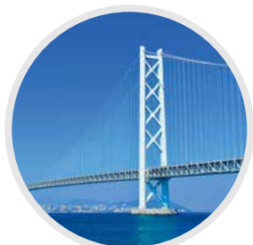
Akashi Kaikyo Bridge